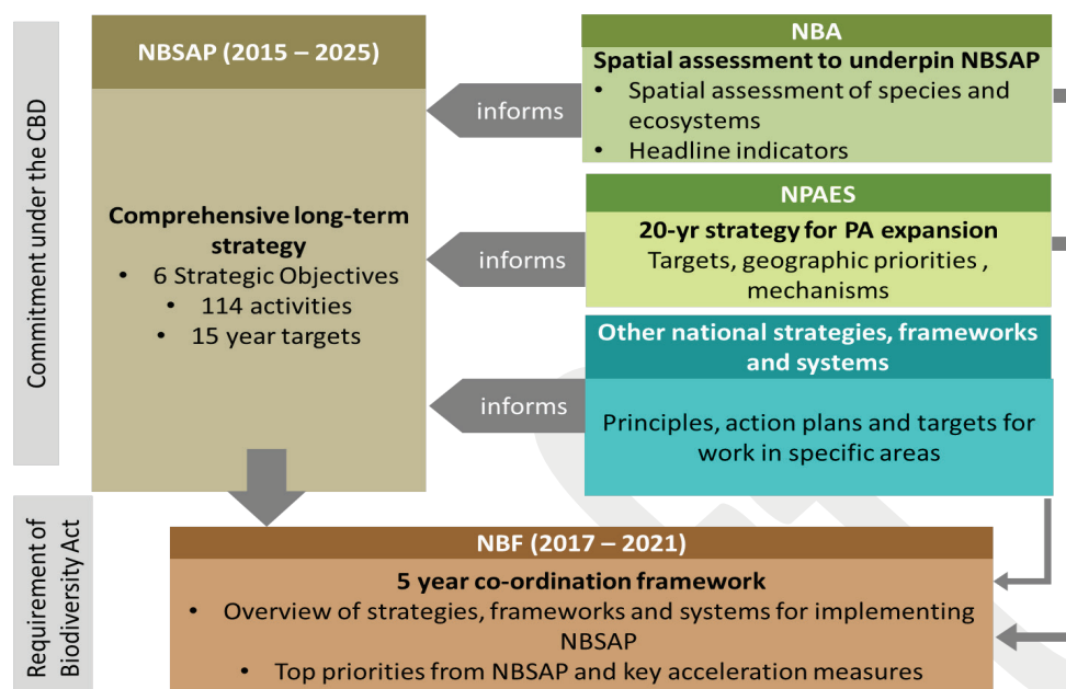
Figure 2: Informants of the revised National Biodiversity Framework

their sustainable use). The relationship between the NBF, NBSAP, NPAES and other key strategies is illustrated in Figure 2 .